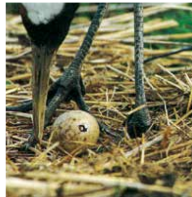
A chick about to hatch

The site was placed under the management of Kushiro Zoo in April 2000, and efforts have been made to promote the protection and propagation of Japanese cranes through collaboration with the zoo's Japanese Crane Conservation and Propagation Center.