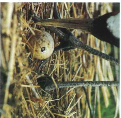
A chick about to hatch

(The beak can be seen protruding through the shell.)